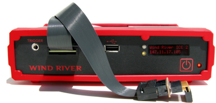
Figure 1: Wind River ICE 2

Wind River ICE 2 was designed in concert with today's leading SoC vendors. Through its tight integration with the debug port on the industry's leading 32- and 64-bit single core and multi-core SoCs, Wind River ICE 2 provides developers with direct access and control of their target device under development or test. Having this control means that developers will have access to status information for their target at all times, regardless of its operational condition. Since Wind River ICE 2 leverages the debug control block of the microprocessor, it is not dependent on an operating system to work and it can provide the developer with target access even when there is no operating system running on the target.